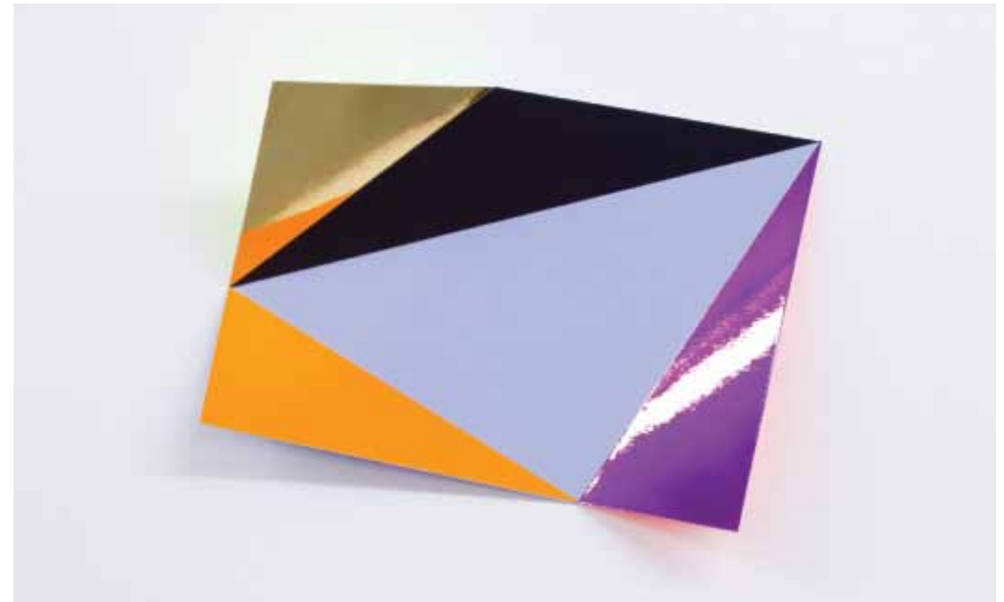
WP87, Paper, 29.5 X 42 X 10cm, 2011