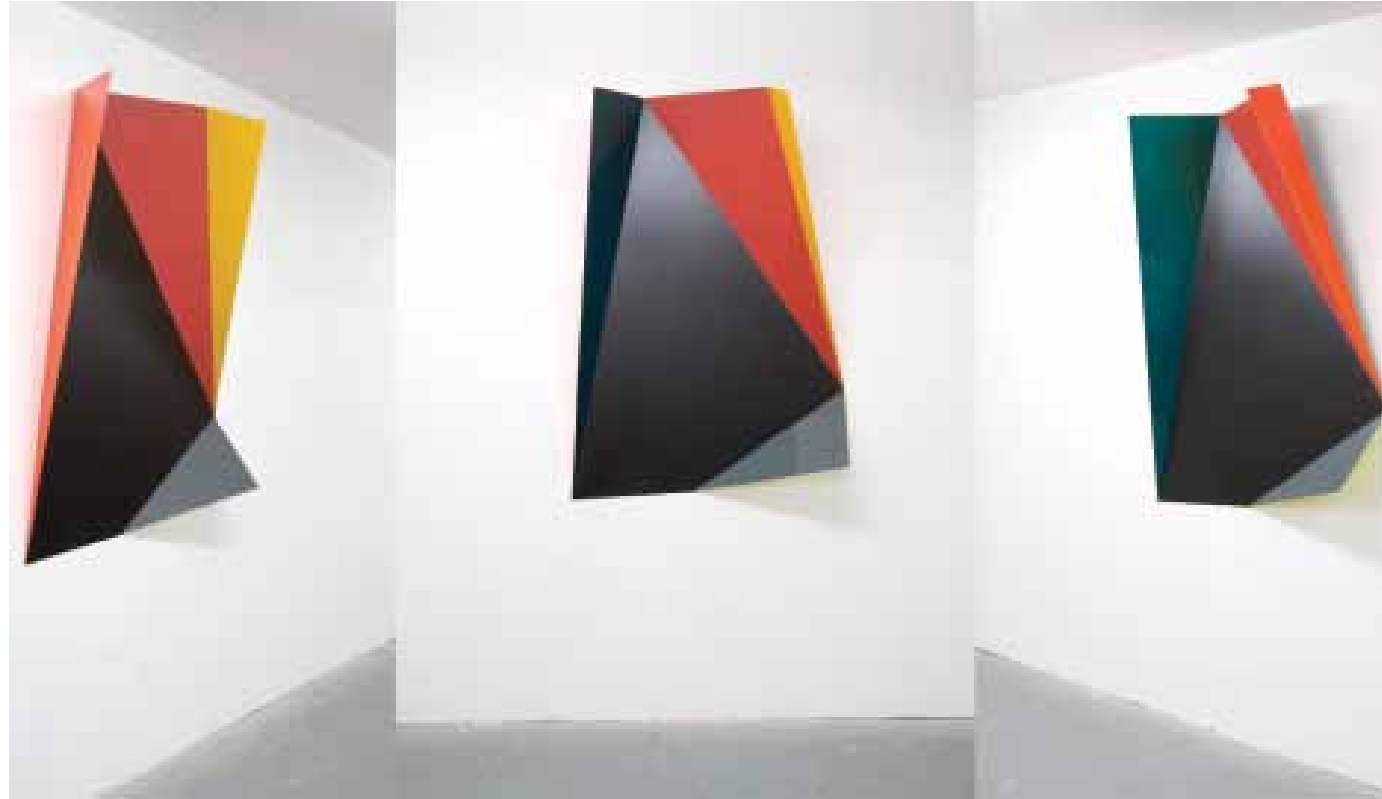
No.245, Paint on mild steel, 125 X 90 X 11cm, 2011