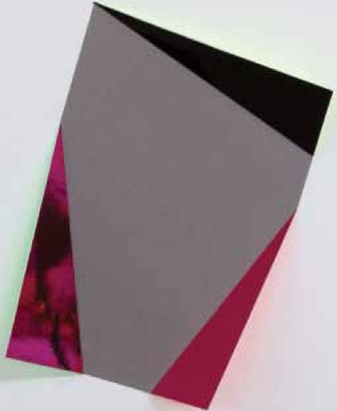
WP93, Paper 42 X 29.5 X 10cm, 2011

Much of my work sits between wall based, and three-dimensional forms. The work takes cues from built and urban environments, looking at colour, line, form, and how they collide in the city. My current work is mainly fabricated from powder-coated and painted metal extruded sections. The language these materials use is at first inspection one of mass production. But then as the complexity of pattern that flows across these linear hard-edged forms is made visible, something far subtler is revealed.