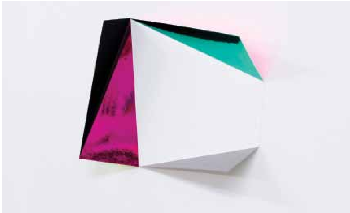
WP85, Paper, 29.5 X 42 X 10cm, 2011