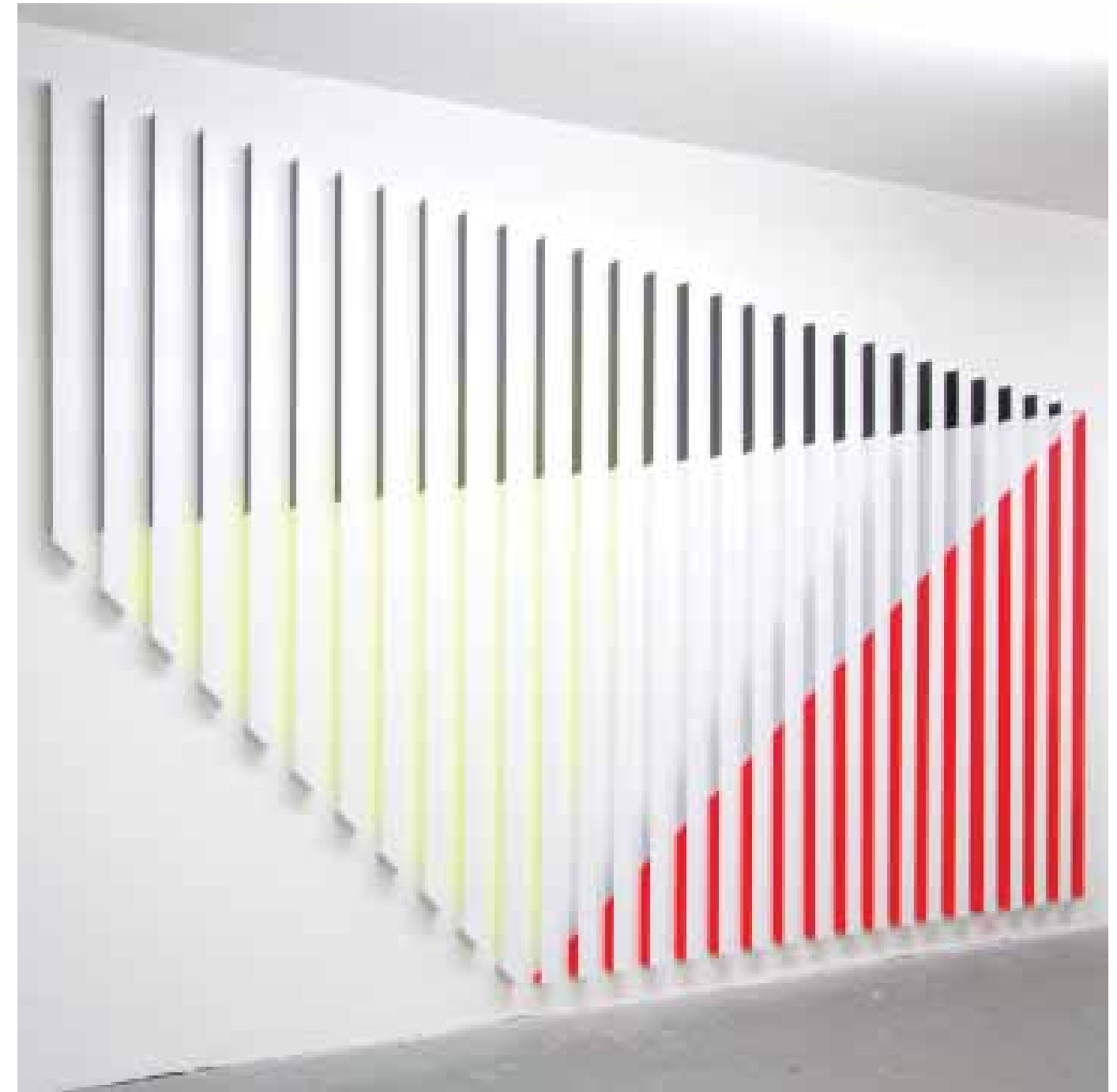
No.266, Paint on powder-coated aluminium, 200 X 295 X 5cm, 30 sections, 2011