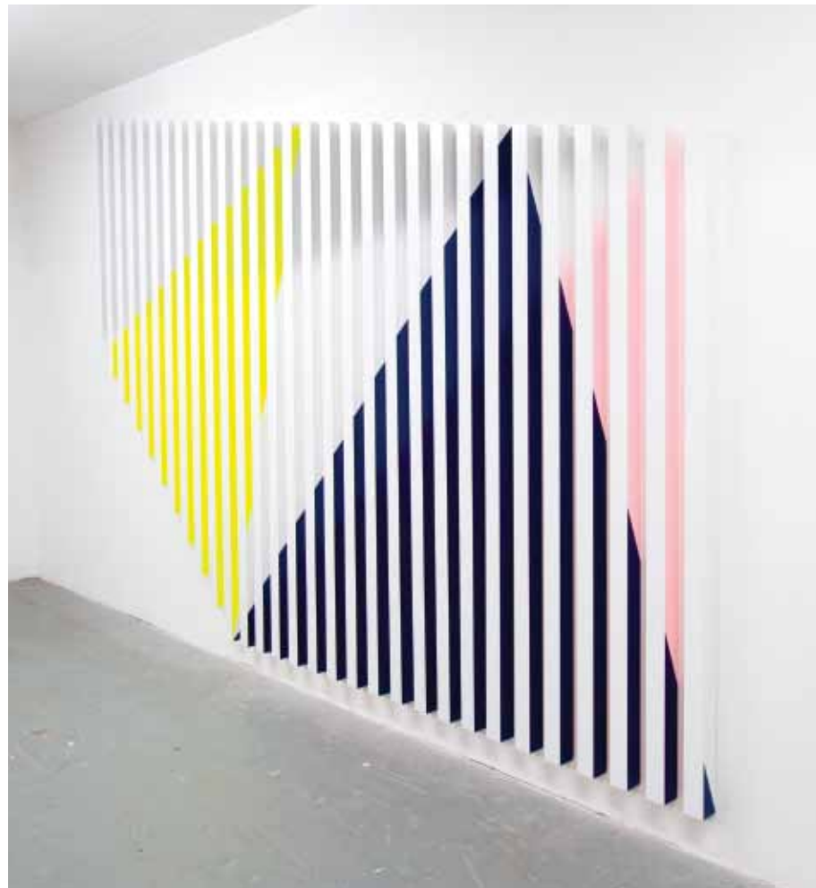
No.266, Paint on powder-coated aluminium, 200 X 295 X 5cm, 30 sections, 2011