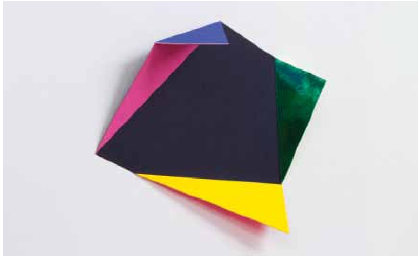
WP86, Paper, 29.5 X 42 X 10cm, 2011