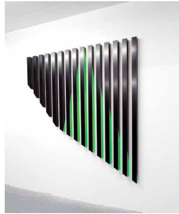
No.268, Paint on powder-coated aluminium, 150 X 145 X 5cm, 15 sections, 2011